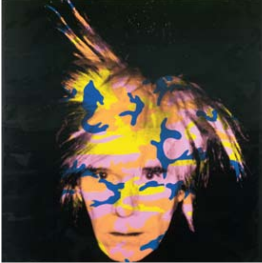
Self-Portrait No.9 1986

Acrylic and screenprint on canvas / 203.5 x 203.7 cm / National Gallery of Victoria, Melbourne / Purchased through The Art Foundation of Victoria with the assistance of the National Gallery Women's Association, Governor, 1987 / © The Andy Warhol Foundation for the Visual Arts Inc.