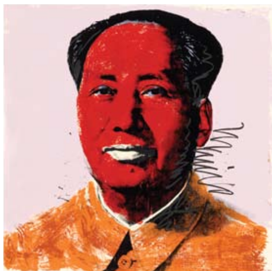
Mao Tse-Tung 1972

Colour screenprint / One of ten sheets: 91.6 x 91.6cm (each) / National Gallery of Australia, Canberra / © The Andy Warhol Foundation for the Visual Arts Inc.