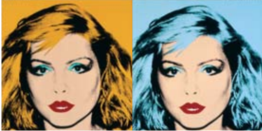
Debbie Harry 1980

Acrylic and silkscreen ink on linen / Two panels: 106.7 x 106.7cm (each) / The Andy Warhol Museum, Pittsburgh / Founding Collection, Contribution The Andy Warhol Foundation for the Visual Arts, Inc. / © The Andy Warhol Foundation for the Visual Arts Inc.