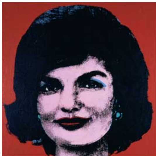
Red Jackie 1964

Acrylic and silkscreen ink on linen / 101.6 x 101.9 x 2.5cm / The Andy Warhol Museum, Pittsburgh / Founding Collection, Contribution The Andy Warhol Foundation for the Visual Arts, Inc. / © The Andy Warhol Foundation for the Visual Arts Inc.