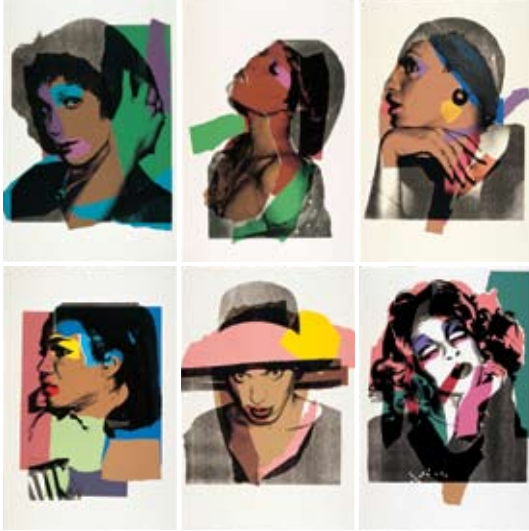
Ladies and Gentlemen (portfolio) 1975

Colour screenprint and photo-screenprint / Six of ten sheets: 111 x 73cm (each) / Queensland Art Gallery, Brisbane / Purchased 1995 with funds from the 1994 International Exhibitions Program / © The Andy Warhol Foundation for the Visual Arts Inc.