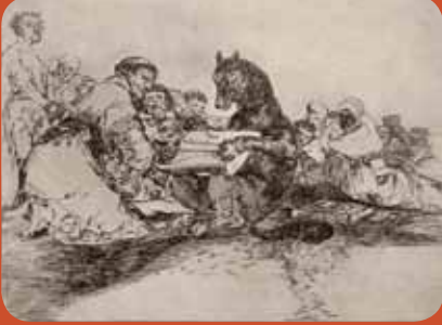
Francisco de Goya | Esto es lo peor! (That is the worst of it!) (detail) | Plate 74 from Los Desastres de la Guerra (The Disasters of War) | Published 1863