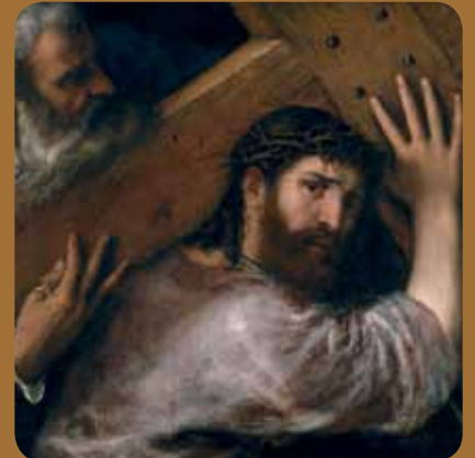
Titian | Christ carrying the Cross (Cristo con la Cruz a cuestras) (detail) c.1565

Painting and religion in Spanish is: Pintura y religion