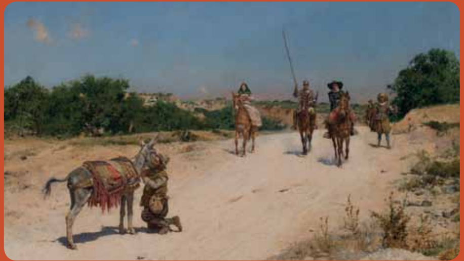
José Moreno Carbonero | Sancho Panza recovers his lost donkey (Encuentro de Sancho Panza con el Rucio) (detail) c.1894

If you were to paint a scene from a Shakespearean play, which would you choose? Why?