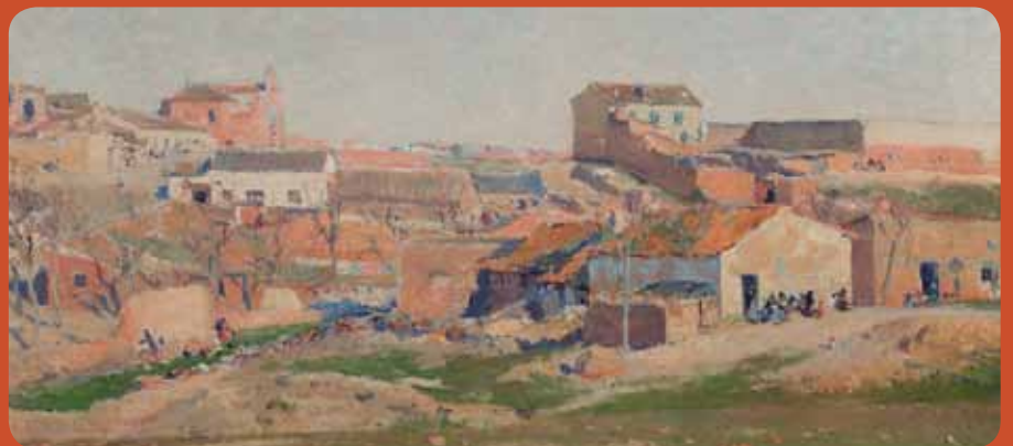
Aureliano de Beruete | Bellas Vistas District (Barrio de Bellas Vistas) (detail) 1906

Spain's History, Literature and Landscape in Spanish is: La historia de España, la literatura y el paisaje