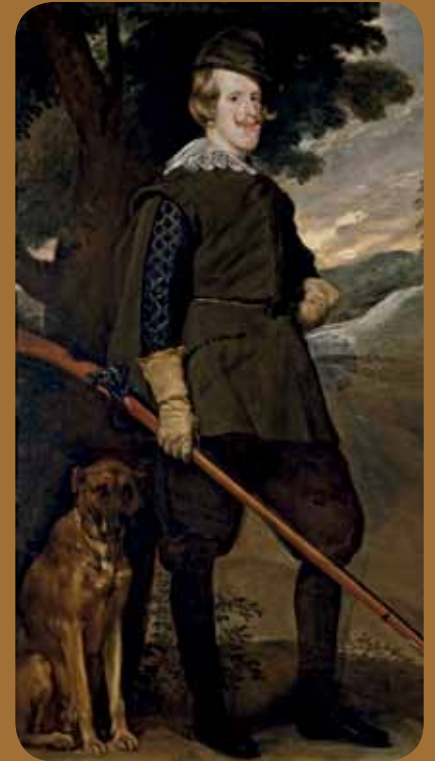
Diego Velázquez | Philip IV as hunter (Felipe IV en traje de cazador) (detail) c.1633