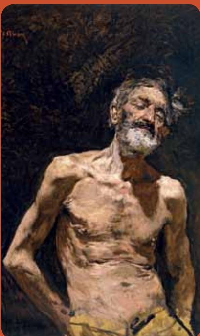
Mariano Fortuny | Elderly nude man in the sun (Viejo desnudo al sol) (detail) 1871

What technological invention contributed to the change from idealistic to expressionistic representation in the mid 1800s?