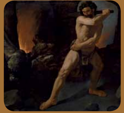
Francisco de Zurbarán | Hercules and Cerberus (Hércules y el Cancerbero) (detail) c.1634