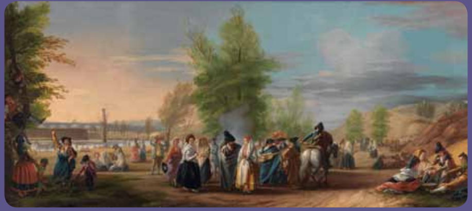
José del Castillo | The Meadow of San Isidro (La pradera de San Isidro) (detail) 1785

The Meadow of San Isidro may be viewed as an allegory of the ages of man, wherein the circular movement of the pilgrims following the rider evokes the course of a lifetime.