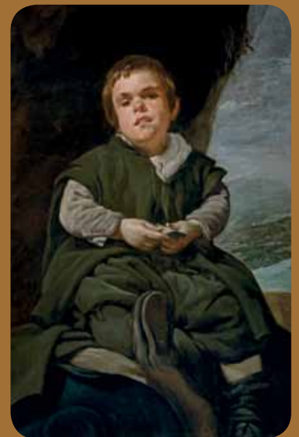
Diego Velázquez | Francisco Lezcano, known as ‘the boy from Vallecas’ (Francisco Lezcano, ‘el Niño de Vallecas’) (detail) c. 1636–38

Physically unique people in Spanish society were sometimes given a place in the royal court as jesters or buffoons. They were seen as curiosities and evidence of the variety of human experience.