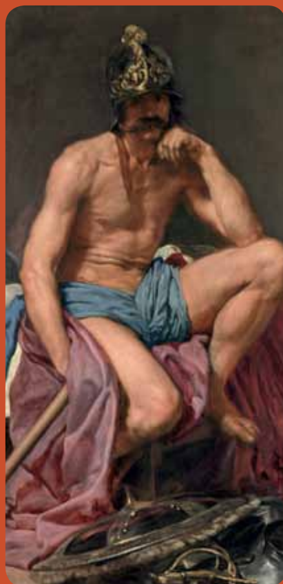
Diego Velázquez | Mars (El dios Marte) (detail) c.1638