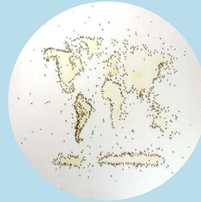
Rivane Neuenschwander Contingent 2008