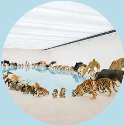
Cai Guo-Qiang Heritage 2013