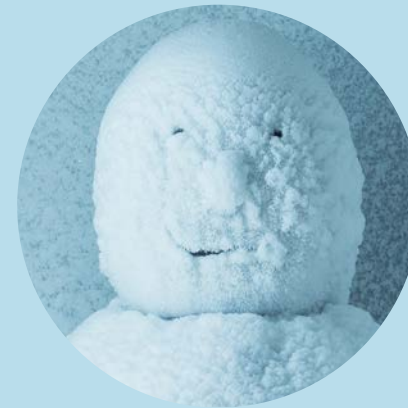
Peter Fischli and David Weiss Snowman 1987/2017-19