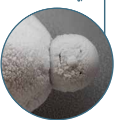
Peter Fischli and David Weiss Snowman 1987/2017-2019