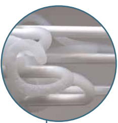
David Medalla Claud Canyons No. 25 1963/2015