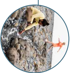
Olafur Eliasson Riverbed 2014