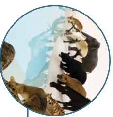
Cai Guo-Qiang Heritage 2013