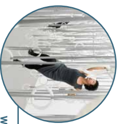
William Forsythe The Fact of Matter 2009